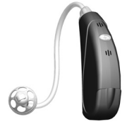
Quantum 20 M micro BTE

Quantum 20 micro BTE is suitable for fitting mild to severe hearing losses and can fit audiogram configurations ranging from reverse to precipitously sloping.